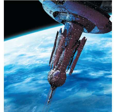
An artist's impression of a 'generation ship'.

Aurora KIM STANLEY ROBINSON Orbit : 2015.